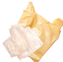
NO Loose Plastic Bags, Bagged Recyclables or Film

Empty recyclables directly into your bin