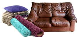
NO Clothing, Furniture or Carpet