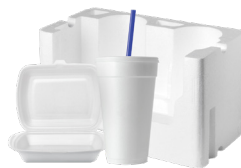
NO Foam Cups, Containers or Straws