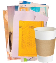
Paper & Paper Cups