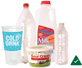
Plastic Bottles, Cups & Containers