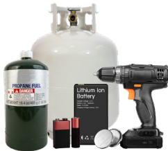
NO Batteries, Power Tools, Flammables or Hazardous Waste